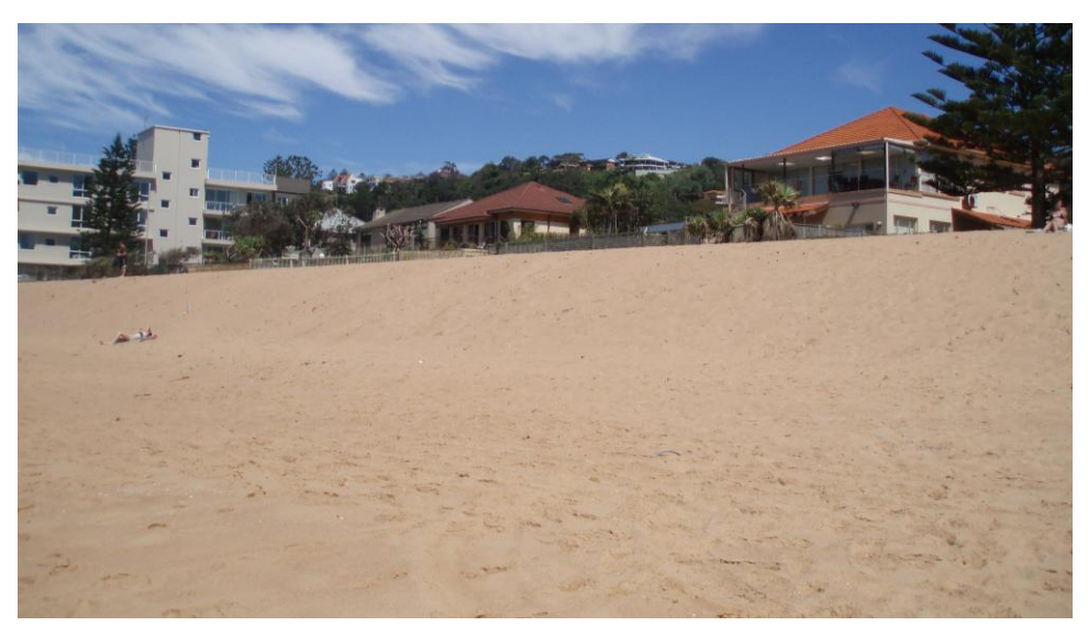
Figure 3: Pre-Storm (March 2007) Conditions in Vicinity of Figure 2 Photograph at Narrabeen Beach

Although these rock works were often hastily installed without detailed designs, they have generally prevented damage to structures in Immediate Hazard Zones (had the works not been there) along Collaroy-Narrabeen Beach for almost 40 years, while causing no significant impact on beach amenity (being buried under sand) for most of the time, see Figure 3. The works have had no measurable effect on long term sediment transport or stability of the beach.