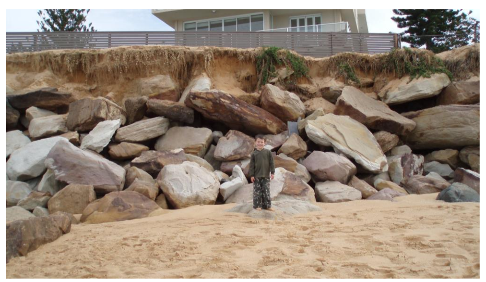
Figure 2: Exposed Rock Protection at Narrabeen Beach in July 2007

were installed as an emergency response to storms, particularly in 1967, 1974 and 1998 (see Figure 2 for example).