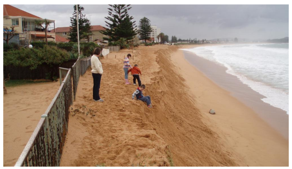
Figure 1: Erosion Escarpment at Narrabeen Beach in June 2007

For these reasons, "Part 4c sand/sandbags ECPW" are likely to be irrelevant to most Warringah landowners.